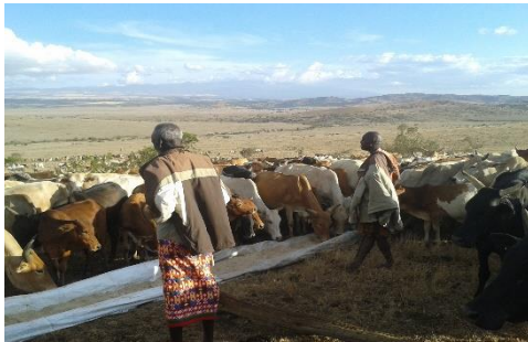
Community cattle being fed

Borana will continue engage NDMA through LWF on additional supplementary feeds to mitigate serious livestock 'losses in the pastoral communities adjacent to Borana.