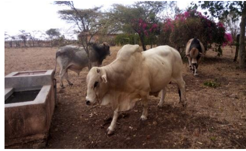
Picture: Borana Bulls that were given free of charge to mount the community cattle

Several meetings were held with the owners of community cattle during the period to ensure they respect the grazing boundaries. Basic principles on HM were also introduced as well as general rules for the conservancy and Security protocols