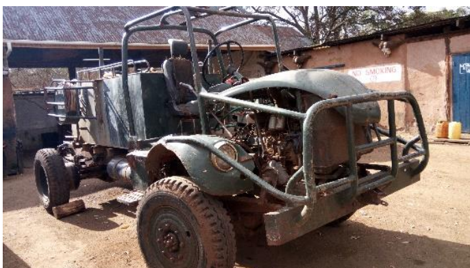
Picture: Borana's small but critical water bowser

The Water problem was compounded more by the current drought. The small water bowser had to make more than two trips every day to supply water to chumvi and Sanga areas bearing in mind that most of the security internal Security outposts and Livestock bomas also rely on the water bowser for water supply on a weekly basis.