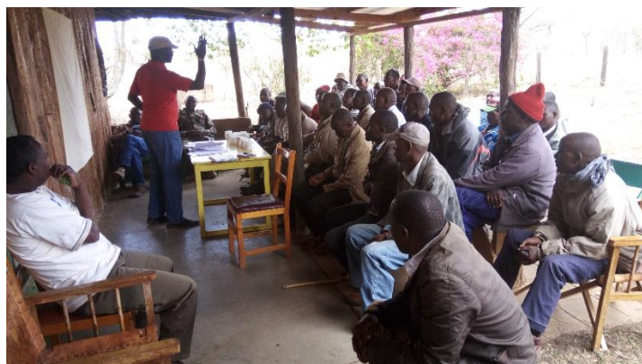
Members of Oramat Lenaboisho meeting held at Borana Head quarters

The Bylaws of Oramat Lenaboisho Sacco (proposed name) have been drafted and the current owners of the steers in the system will be members. The Sacco is expected to help members in the long run to access agreed emergency loans to cater for urgent needs and the amount borrowed will be deducted when the borrower (s) steers are sold. The members of Oramat Lenaboisho recently met and elected interim officials of the Sacco as one key requirement prior to registration. The registration process is expected to be complete by end of April 2017.