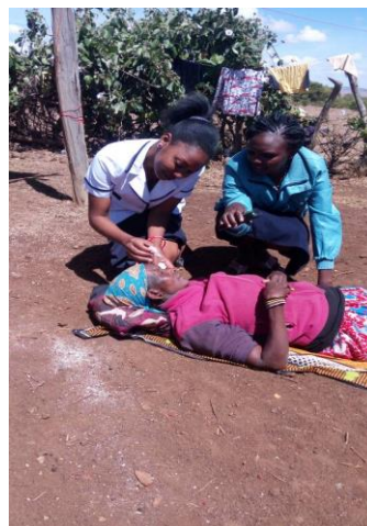
Borana Mobile clinic nurses out in the communities

Borana will forever be grateful to the Donors for their immeasurable support, for without them, the significant progress made so far would not have been achieved.