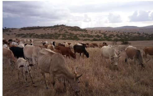
Community Cattle grazing at Borana

The community stock encountered some challenges attributed to drought in which 6 calves and 10 Cows were lost during the month of March. 3 deaths were attributed to predators (lions and Hyenas) while the rest was as a result of drought and livestock diseases.