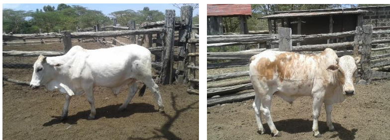
Picture: some Community steers that were recently sold

Borana has also ensured that the steers continue to be managed very well where mineral supplements were given every week and dipping done once a week. Due the current drought, more supplements were provided to ensure the steers continue to be healthy. Three (3) steers were lost during the period, 2 were killed by lions while one was accidentally pushed into a trough by other steers.