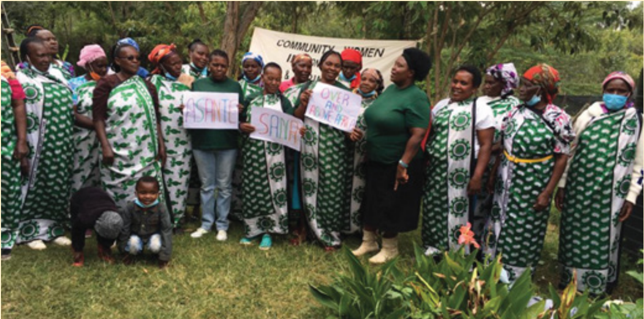
OPP women group together with OPP primate guardian team during an awareness meeting