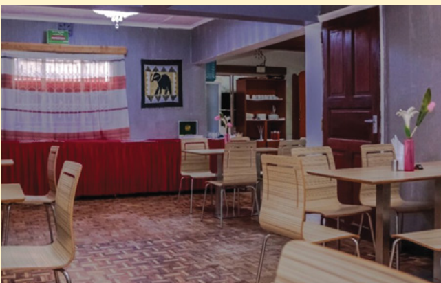
Photo captured from LTA member's Beisa Hotel's restaurant during the Covid 19 Pandemic period

GiveDirectly, a leading global NGO specialized in delivering digital cash transfers, reached out to the Laikipia Tourism Association to partner in an emergency cash program as part of their Covid 19 response in Kenya.