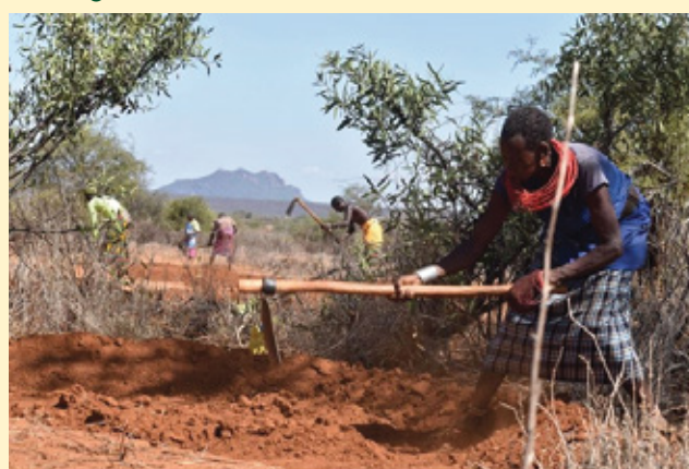
Community members of Lekurruki digging semicircular bunds that will help to reduce water runoff and increase chances of vegetation growth because of the moisture retained in the soil.