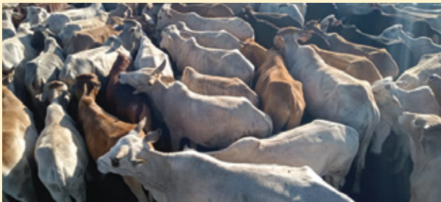
Steers undergoing fattening at Borana Conservancy

Our Livestock to Market programme started on a very low note this year with moderate number of cattle sales in the First quarter (January- March 2021). We managed to sell 43 steers and 0 cull cows worth Kshs. 1,723,940. No sales were made in the second quarter (April -June), 32 steers were sold in the third quarter (July-September) worth ksh.991,105. No sales were also recorded in the final quarter of the year.