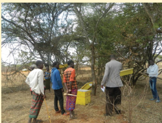
Bee keeping training session with community members of Mukogodo Forest

DUPOTO cooperative was formed in February as an umbrella body for all forest user groups focused on bee keeping. A meeting was held between the leadership of DUPOTO and ILMAMUSI CFA and a working arrangement was established.