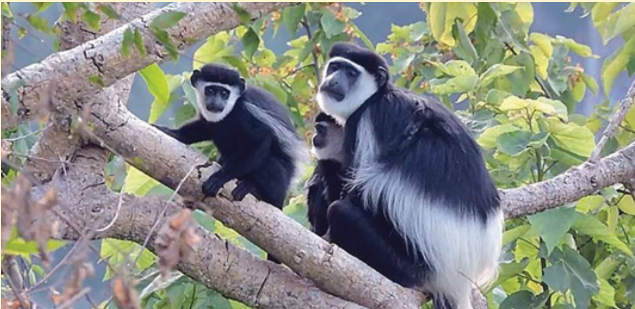
Image of the colobus Monkey that OPP is working towards protecting and conserving within the landscape

OPP is the most recent partner to benefit from a working arrangement with the Forum. This grass-roots community program is led by the residents of the upper section of the Ontulili River. The group is led by a board and supports the protection of primates and their habitat along the river. It also supports broader conservation efforts that include tree nursery development, riparian restoration, and art for nature activities that support conservation.