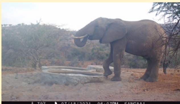
A camera trap image of an elephant drinking water at the Sangaa water point during the day

The Disney Project involved mounting of camera traps at three locations to monitor human – wildlife conflict at Upper Sanga, Lower Sanga, and Loontana in Sieku location. The project has been fairly successful but with some challenges on vandalism and theft of storage cards reported at both camera traps in Sanga. The project is funded by Disney Foundation, through our partner, the Laikipia Wildlife Forum. It entailed installation of water supply for the communities of both Upper and Lower Sanga before the camera traps were mounted at the water troughs to monitor their use.